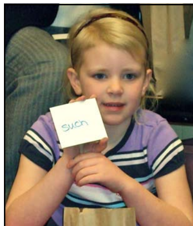
Title I brings parents and teachers together to work with children.

Title I is the largest federally-funded educational program. The federal government provides funding to each state. State educational agencies send this money to school districts. How much money each school receives is determined by the percentage of those who qualify for the Free & Reduced Lunch program.